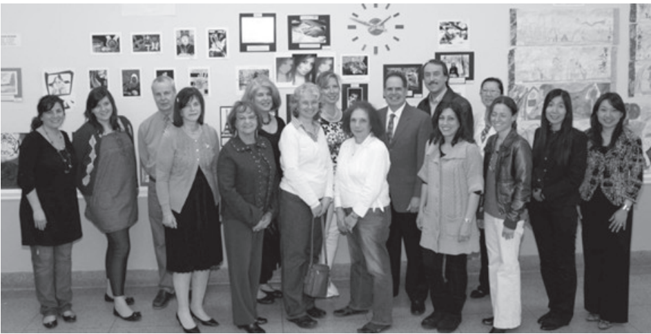
Pictured are art teachers of the Herricks and Manhasset school districts, representatives of the Town of North Hempstead, and CAANH board members.